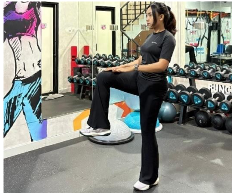
Figure 3 Knee up

Starting by standing upright with your feet shoulder-width apart, lift your knees parallel to your hips, starting with the right knee and then the left. This movement works the rectus femoris muscle . Count each knee as one when the right and left knees rise. Do 15 repetitions in 3 sets.