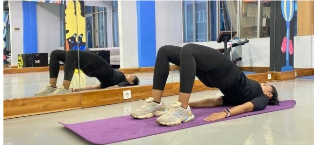
Figure 4 Bridge pose