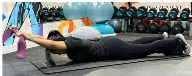
Figure 6 Back up rubber

Lie face down, straighten your arms, and hold the elastic. Lift the elastic as high as possible, keeping your head still (only your arms should be raised). This movement works the trapezius muscles . Do this for 10 repetitions, 3 sets.