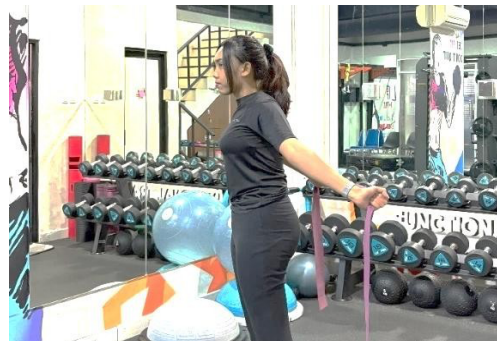
Figure 1 Shoulder roll rubber

Standing position, feet shoulder-width apart. Hands holding the elastic , shoulders rotate from front to back and back forward 180°. This movement trains the shoulder muscles, especially the deltoids , anterior head , and middle head . Do this movement 15 times x 3 sets.